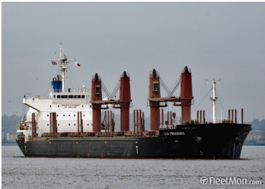
The Chinese ship “Sen Treasure”

Please observe: An ITU footnote says, that 14250 – 14350 kHz is also available for commercial and other purposes in Region 3, too!